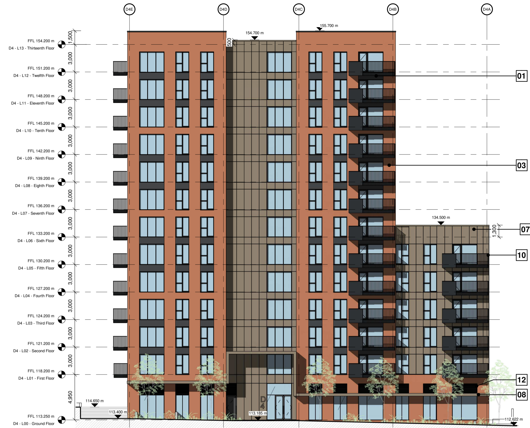
2 Proposed Block D4 - East Elevation 1 : 200