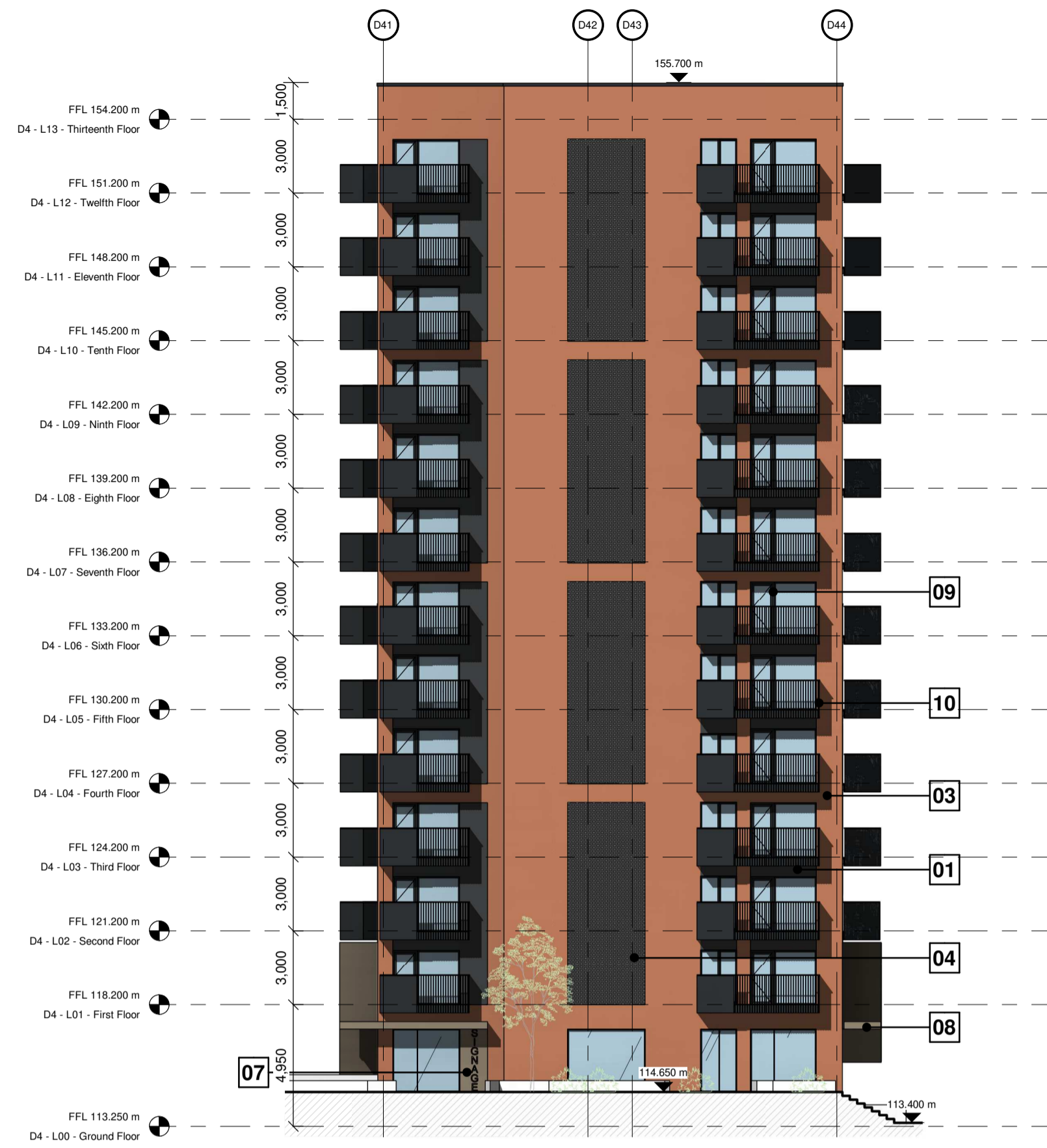
1 Proposed Block D4 - South Elevation 1 : 200