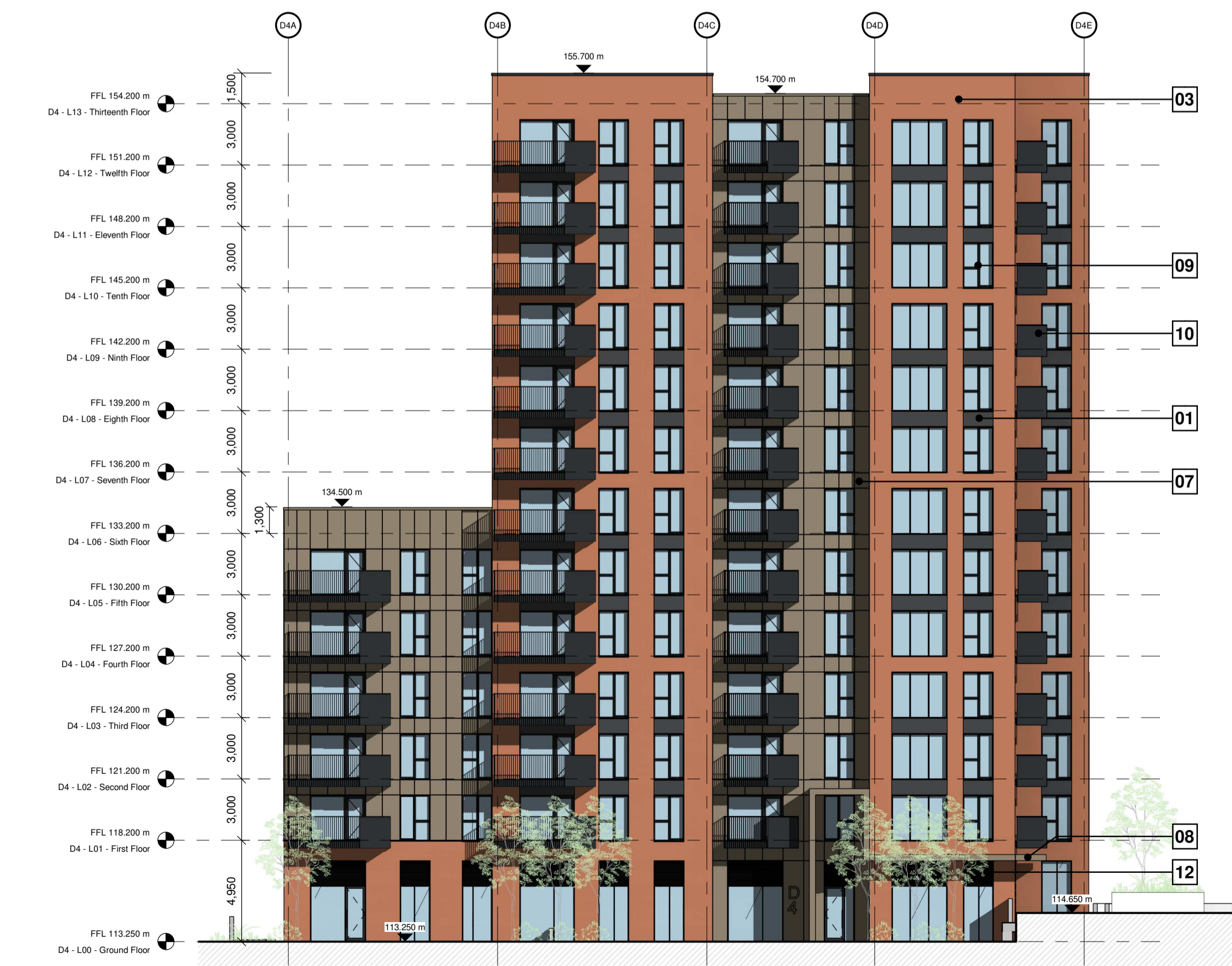
4 Proposed Block D4 - West Elevation 1 : 200

Notes: - Do not scale from this drawing. Use figured dimensions in all cases. - Verify dimensions on site and report any discrepancies to the Architect immediately. - This drawing is to be read in conjunction with the Architect's Specification. - © This drawing is copyright and may only be reproduced with the Architect's permission.