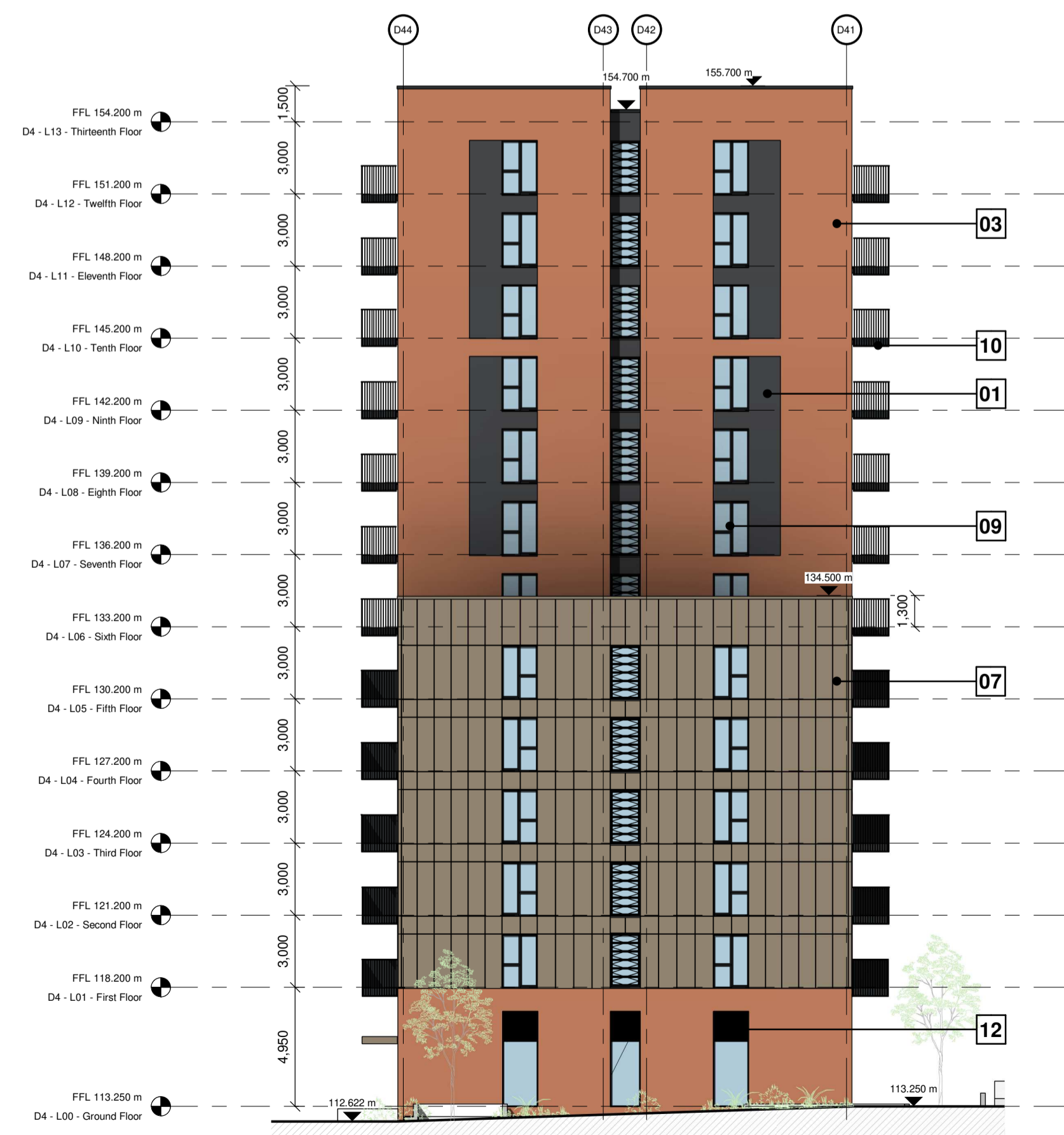
3 Proposed Block D4 - North Elevation 1 : 200